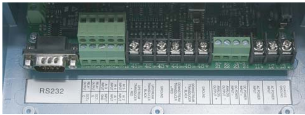
Electronics (Close Up)